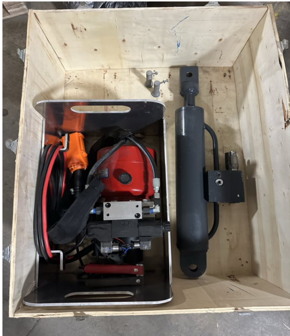
10T RAM (includes 2 Pins) and 12V Battery Power Unit